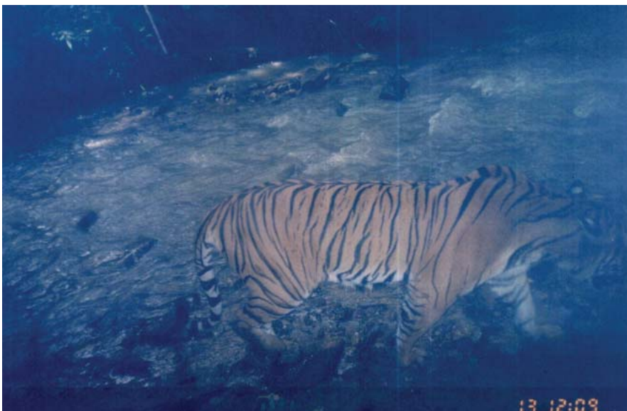
Fig. 1. A camera trap picture was taken of a tiger at the Xishuangbanna Nature Reserve in Yunnan, China on May 13, 2007.

Female tigers normally start reproducing at between 3 and 4 years of age and males do not generally start until they are about 5 years old when they establish a territory of their own (Smith & McDougal 1991). Mating takes place at any time of year, but most frequently from late November to early April. Female tigers give birth to 2–4 cubs after a gestation of 100–104 days. The female rears the cubs alone, and they become independent at 18–28 months old. Females usually breed